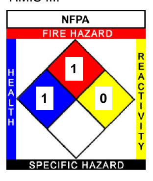
Health = 1, Fire = 1, Reactivity = 0 H1/F1/PH0